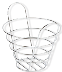
Nursery Wire Baskets