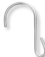
Multi Radii Bent Wire forms