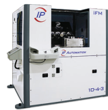
iFM Machining Center