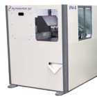
iFM-6 Machining Center