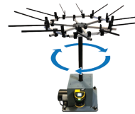
Parts Handling Solutions